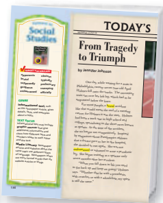
Connect to Social Studies; “From Tragedy to Triumph”