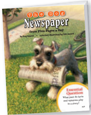
Main Selection: The Dog Newspaper