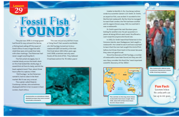
Short Article Fossil Fish Found!