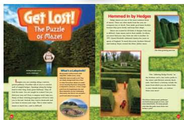
Long Article Get Lost! The Puzzle of Mazes